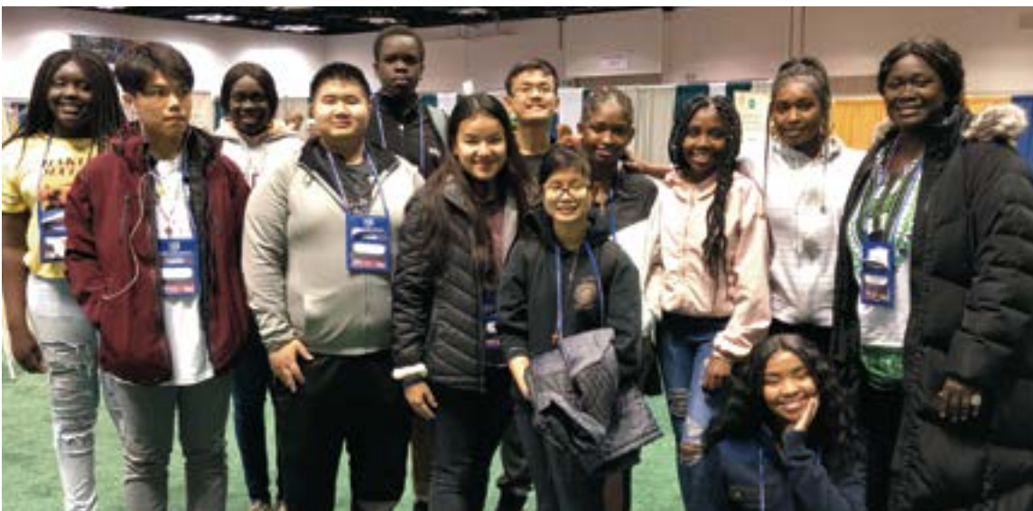
Youth from St. Ambrose Cathedral Parish in Des Moines checked out the thematic village, featuring activities and booths of organizations from all over the United States.